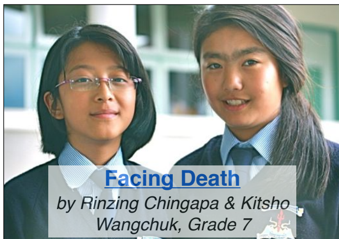
Facing Death by Rinzing Chingapa & Kitsho Wangchuk, Grade 7