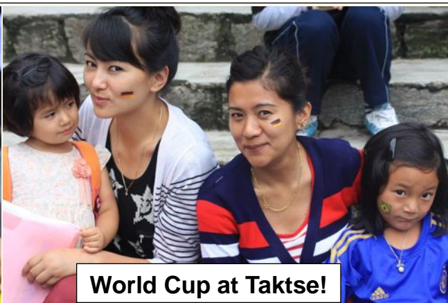
World Cup at Taktse!